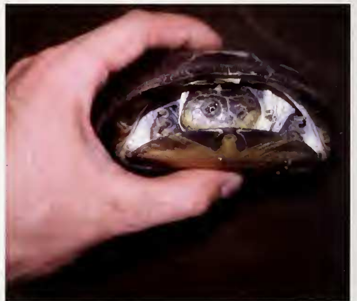
Fig. 8. Pelusios castaneus from near Bohicon, southern Benin.

Remarks. This common and widespread species was observed in all habitats including human settlements where vertical structures such as tree trunks and/or house walls were preferred. It was, however, never seen in the closed forest.